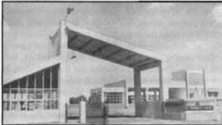
Drip Irrigation Pipes Manufacturing Plant, Gujarat

sonality oriented Quality Control on Projects'. This system covers all aspects of construction and has been time-tested for projects all over the country.