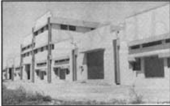
Seed Processing Plant, Karnataka

They specialise in designing industrial complexes. Most of their clients are industrial houses and public limited companies.